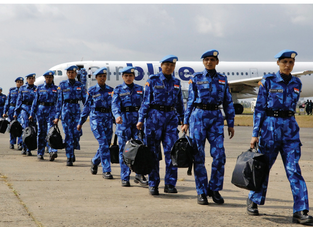
The UN's first all-female peacekeeping force arrives in Liberia.