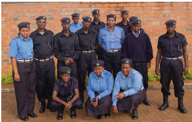
Gender-based violence officers in Rwanda

Training must be reinforced by changes in operating protocols and procedures, concrete incentives to motivate and reward changed practices, and sanction systems to prevent or punish failure to comply with a gender equality mandate. Finally, performance measures should record staff commitment to gender equality principles, as reflected by new types of policing that respond to women's and men's needs so that these innovations do not go unrecognized.